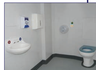
Typical patient bathroom at Tameside Mental Health Hospital