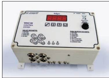
WDC100 control unit

experiences of hospitals elsewhere, a new integrated mental health unit for older people fit for the 21st century and beyond has been shaped.