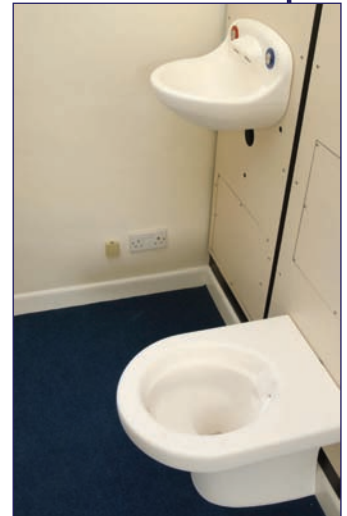
CWC_150 toilet and ALS_80 basin

Wallgate continues to develop its sanitaryware ranges to suit the changing needs and demands of its clients.