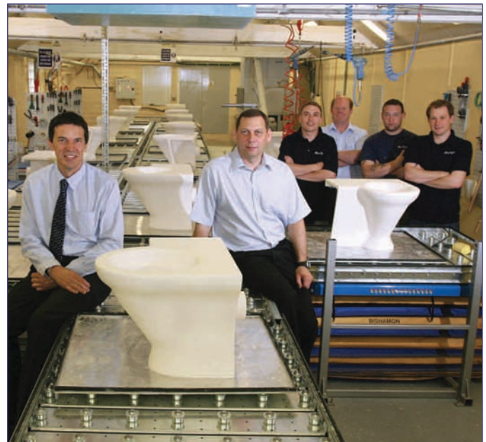
Wallgate's new solid surface casting line at their Wilton factory